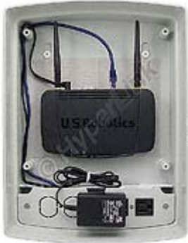
Shown with U.S.Robotics® USR5450 Access Point