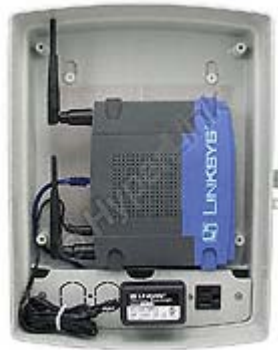
Shown with Linksys® WAP54G Access Point